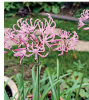
Pictured: colourful nerines make a pretty display