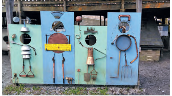
Above: This photo was taken at the Centre for Alternative Technology in Wales

In the introduction to our little booklet of challenges about being a Quaker it says “... it is for the comfort