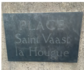
Left: a commemorative plaque marks the naming of the West Bay slipway after Bridport's twin town in France

A Come & Sea event called Ocean Treasures took place over the weekend of 9–10 August – and what