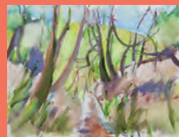
The Nature Reserve by Trevor Powell