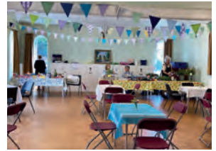
A few photos showing our versatile church hall in use at this summer's cream tea