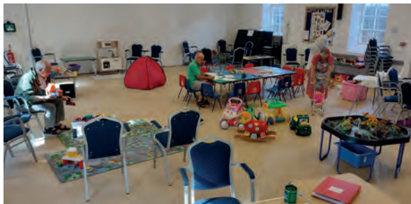
Above: the United Church Hall set up for Little Lambs

Do you come into town on a Wednesday or Saturday morning? Come and have a cuppa at our coffee mornings, 10am to 12 noon. There's always someone to chat to, and on the tables you'll find prayer boxes where you can write on a slip of paper whatever you'd like us