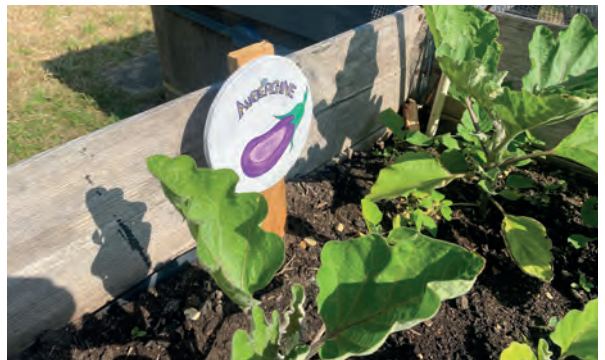
From top: A productive Bridport allotment; the aubergines are doing well; a bumper harvest from Bridport Community Orchard's allotment