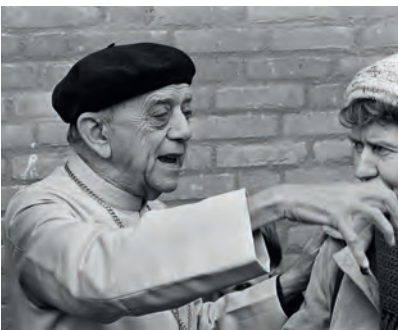
Left: Dom Hélder Câmara in the 1980s

Sunday Mass is at 10am at the Roman Catholic church in Victoria Grove and is streamed online at www.bridportcatholics.org.uk and on the Bridport Catholic Parish Facebook page. For updates about Sunday and weekday Mass, see the weekly newsletter on the website or look for updates on Facebook.