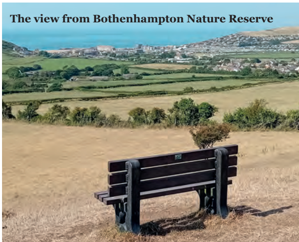
The view from Bothenhampton Nature Reserve

Visitors to the reserve can enjoy an abundance of wildflowers such as pyramid orchids, vetches and trefoils that thrive here, as do many insects including spotted wood, meadow brown and comma butterflies. Large numbers of birds live in the woodland – starlings, rooks and nightingales, buzzards and kestrels – while mammals including stoats and bats can also be spotted, and dormice have been recorded on the site.