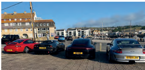
Above: A group of Sunday visitors to West Bay recently arrived in these splendid cars!

a great weekend it was! We saw lots of visitors to the transformed St John's Church, as well as enjoying the events on Fisherman's Green.