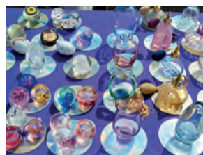
Above: Pretty things for sale at West Bay market