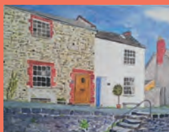
6 and 7 Sunnyside by Grey Innes

Advance notice of another village hall event is for a murder mystery evening with cheese and wine on Saturday 11 October at 7pm. Proceeds to hall funds.