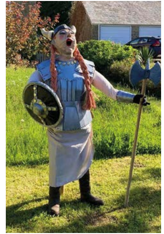
Pictured: 'Brünnhilde the Valkyrie', one of the exhibits in this year's Loders and Uploders scarecrow festival