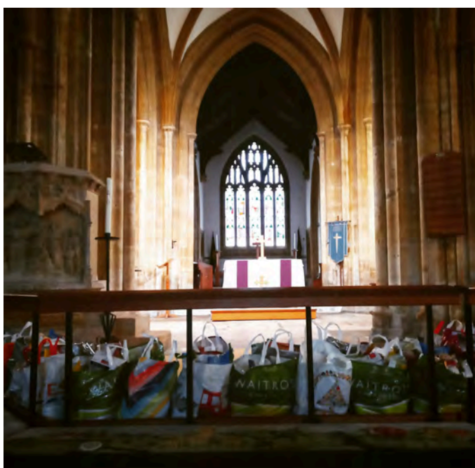
Food parcels in St Mary’s Church ready to be delivered to people in need

If you suspect an email in your inbox is fraudulent, you can report it to Action Fraud on 0300 123 2040 or through their website at www.actionfraud.police.uk .