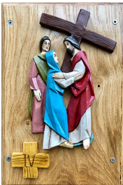
Station IV, Jesus meets his mother, is one of the 14 Stations of the Cross in the prayer garden at St Mary & St Catherine in Bridport

A few years ago, I was fortunate enough to lead a group of pilgrims on the way through the actual streets of Jerusalem