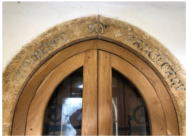
The door to the south aisle in St Mary's bears the inscription: 'Reverence my sanctuary'

The words are taken from the book of Leviticus, which was probably written in the early fifth century BC, but in these days of Covid restrictions, the inscription reminded me once again of the importance of the haven that this building affords to those who seek a place apart in which to find peace and tranquillity, to pray and worship. It has been